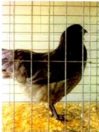
This large fowl blue is the correct shade of blue, but where is the lacing the standard calls for as the Andalusian hen below demonstrates?