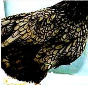
Ameraucana Andalusian from Feather Site, http://www.feathersite.com/Poultry/CGA/Andal/BRKAndalusians.html