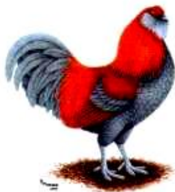
Blue Wheaten Portrait

BB=best of breed RB=reserve of breed BV=best of variety RV=reserve of variety C=cock H=Hen K=cockerel P=pullet AOV=Any Other Variety, AOCCL=All Other Combs Clean Legged (bantam) AOSB=All Other Standard Breeds (large fowl)