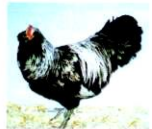
Silver Large Fowl Cockerel By Jim Fegan