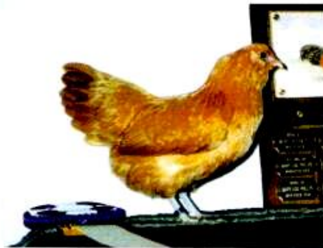
Buff Bantam Pullet